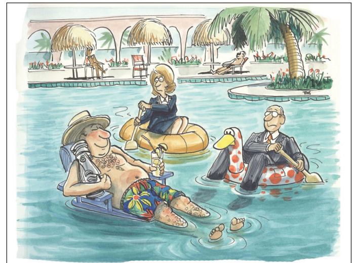
No one could bring him back from his island paradise.

RIGHT ACCORD Private Duty – Home Health Care is a Home Health Agency licensed by the Florida Agency for Health Care Administration (AHCA) who is responsible for health care organization licensure and regulation. (HHA29993655)